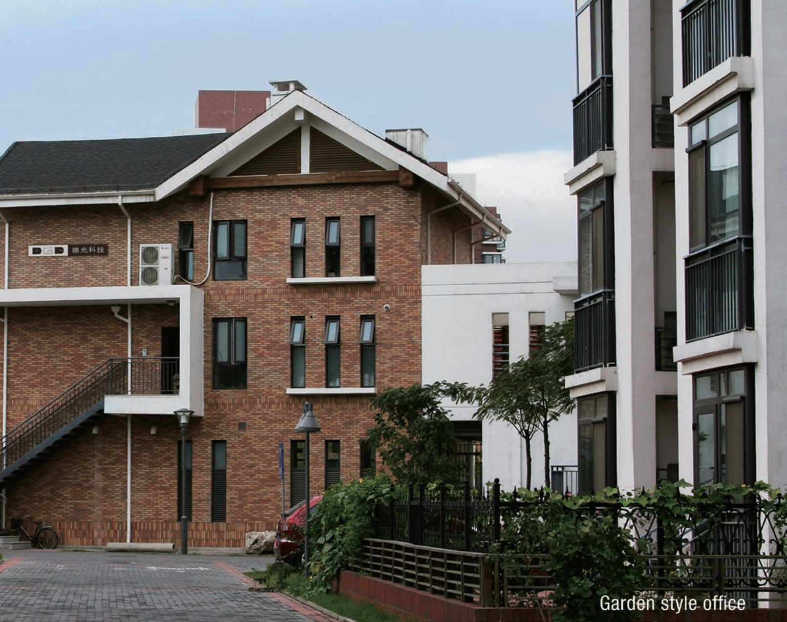
Garden style office

Beijing Dragon Electronics Co. (DGC), China, was established in 1993, ranks among the top manufactures of Non-Destructive Testing (NDT) instruments and digital material testing equipments, such as Ultrasonic thickness gauges, ultrasonic flaw detectors, Hardness testers and surface roughness testers.