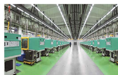
Precision Component Production