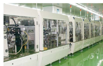
High-effect Automatic Production Line