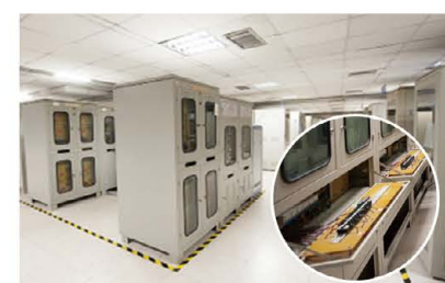
Testing & Analysis