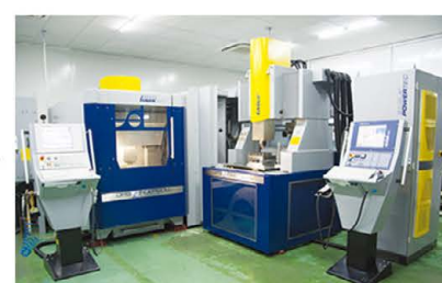
Mold Designing and Manufacturing