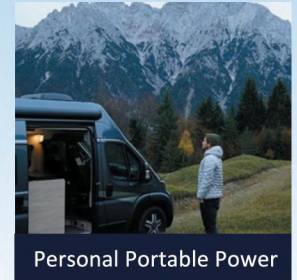
Personal Portable Power