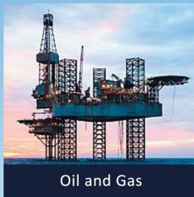
Oil and Gas