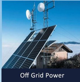
Off Grid Power